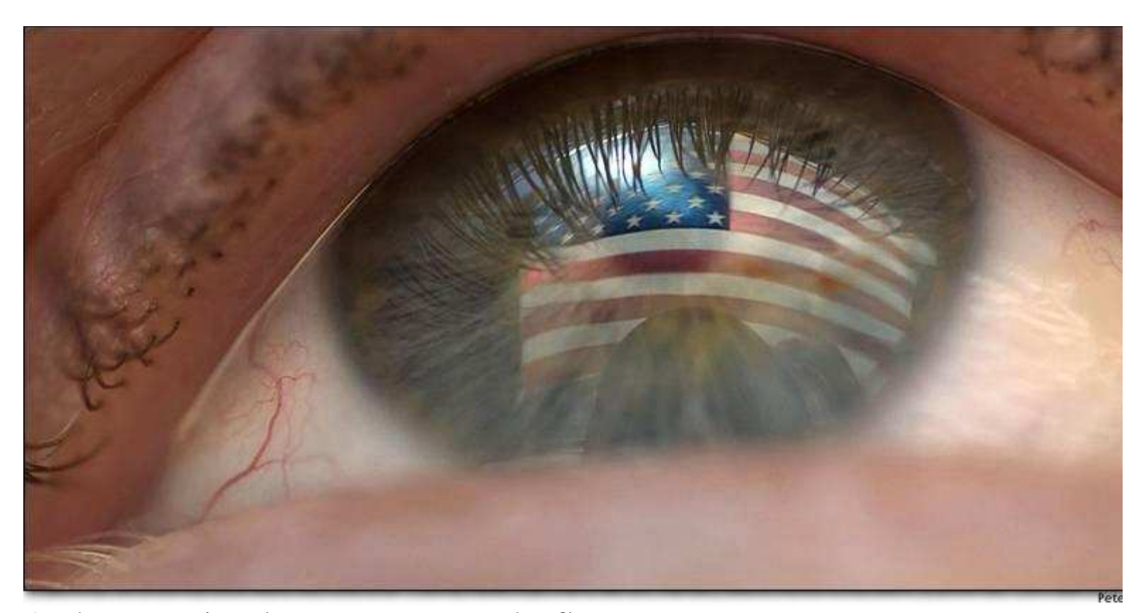
At the same time keep your eye on the flag